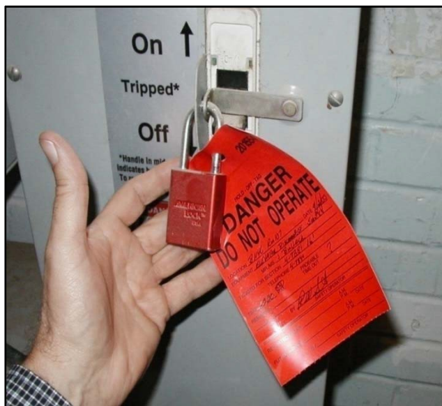
Figure 1. Example of Red Lock/Red Tag (RL/RT) Method

3.2.1.3 The LOTO shall be performed by an authorized Safety Operator (SO) .