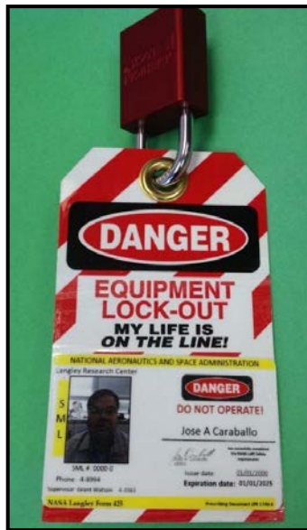
Figure 3. Example of Shop Machine Method

3.4.1.5 A SM LOTO can be used only if all the following exception elements exist, per OSHA 29 CFR 1910.147(c)(4)(i):