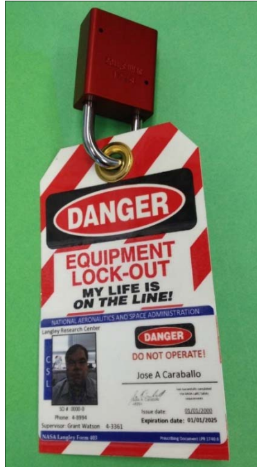
Figure 2. Example of Craft Specific Method